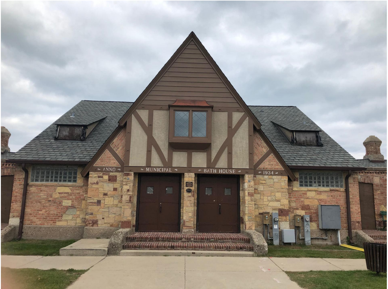
Above: Simmons Island Beach House renovation underway to be completed in 2020

Preservation is about deciding what is important, figuring out how to protect it, and passing along an appreciation for what was saved to the next generation. Preservation is hands-on. -National Park Service